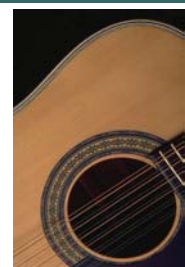
Page 5: Strumming for Jesus!