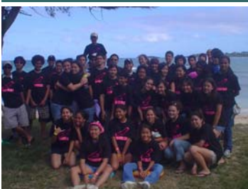
Page 2: Soaring On Wings of Eagles